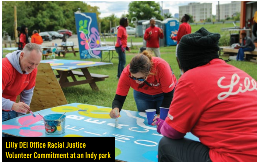
Lilly DEI Office Racial Justice Volunteer Commitment at an Indy park