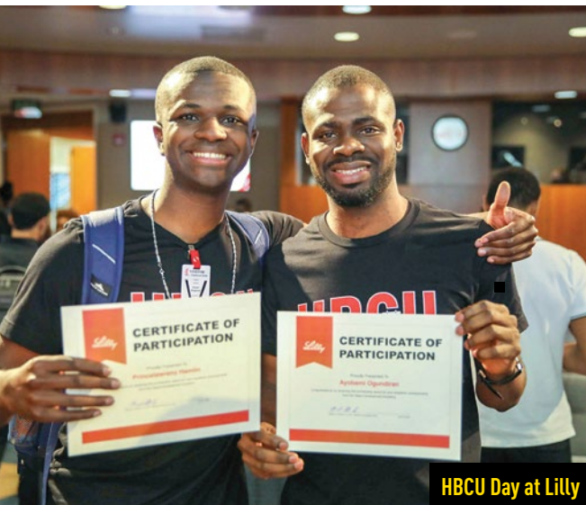
HBCU Day at Lilly

Social impact at Lilly goes beyond financial commitments and dollars spent. Our true impact is demonstrated when we can advance racial justice for Black Americans and historically underserved groups to make life better for people around the world. Here at home, in Central Indiana, we've found ways to deepen our social impact with local businesses and talented professionals.