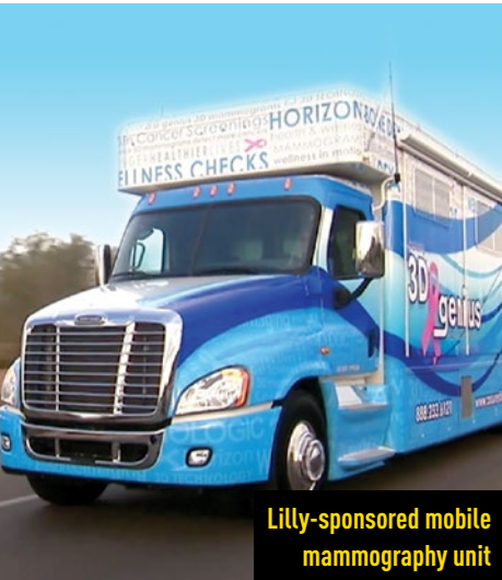
Lilly-sponsored mobile mammography unit